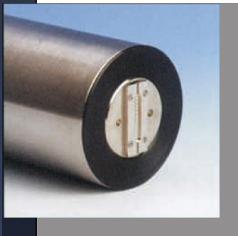
EM-Printhead Small (7 nozzles)