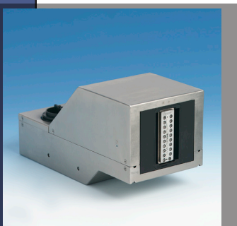
Piezo Printhead Large (352 nozzles)