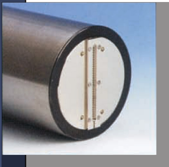
EM-Printhead Large (32 nozzles)